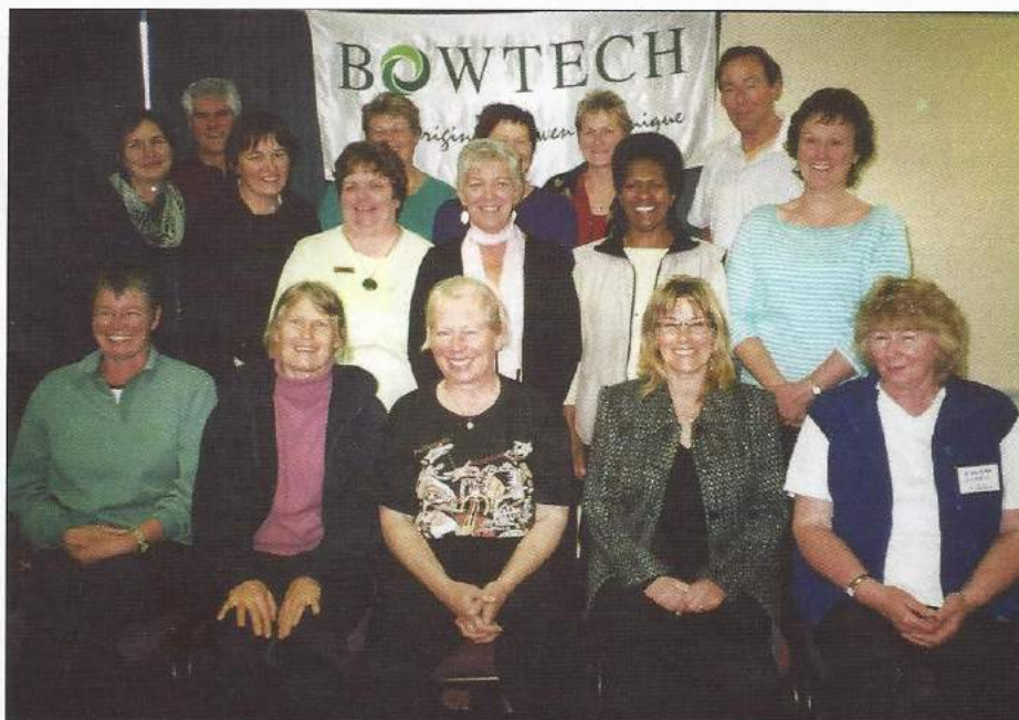
The Rotorua New Zealand Advanced class, September 2005